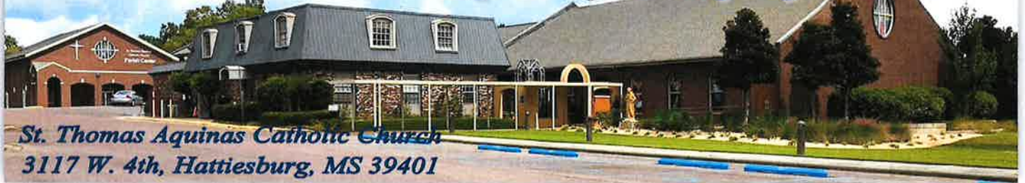
St. Thomas Aquinas Catholic Church 3117 W. 4th, Hattiesburg, MS 39401